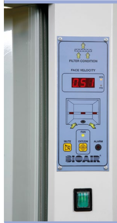
Safehood 120 detail