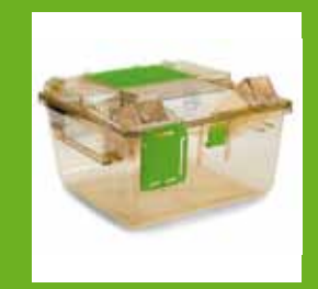
Sealsafe Plus RAT: high containment, protection from allergens, high density and practicality of use.

Sealsafe Plus: high containment, certified protection from allergens, high density and practicality of use. The IVC (r)evolution.