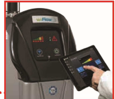
ONE 2 ONE