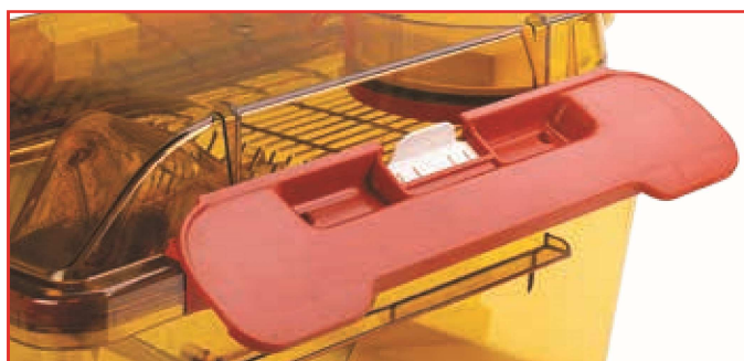
SPECIAL CLOSURE CLAMPS