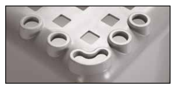
Extra holes in the four corners